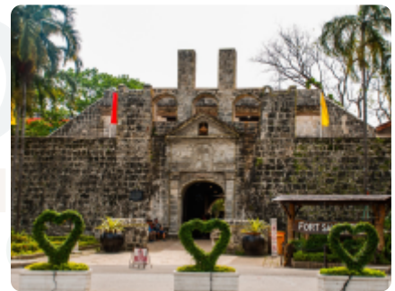
Old Fort San Pedro in Cebu, Philippines.