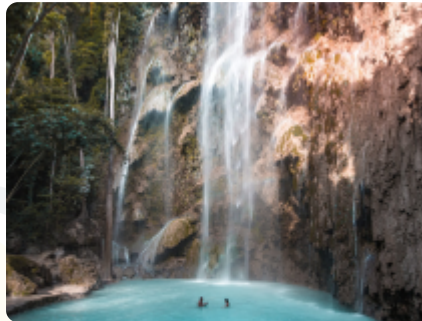
Amazing secret waterfall with blue turquoise water. Tumalog, Kawasan Philippines Cebu Island.