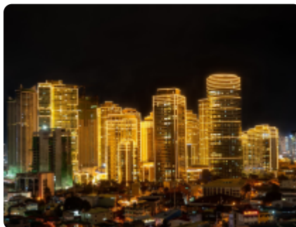
Makati skyline by night, Metro Manila, Philippines