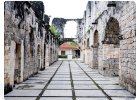
Cuartel Baluarte Ruins in Oslob, Cebu, Philippines