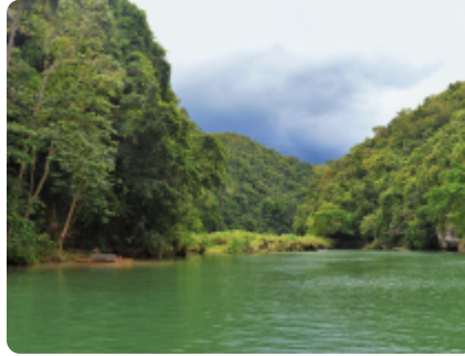
Lake among green hills. Mangrove forest in Philippine Bohol island.