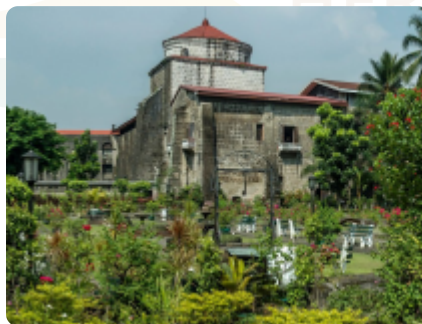
San Augustin church and gardens, Intramuros, Manila.