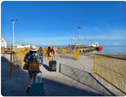
Passengers at Tubigon Pier walking for a ferry leaving for Cebu City.