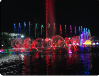
Musical Dancing Fountain in Rizal Park-Liwasang Rizal deemed as the biggest one in the country holds a show of waters soaring up-fireballs-water rockets-peacock spray water screen