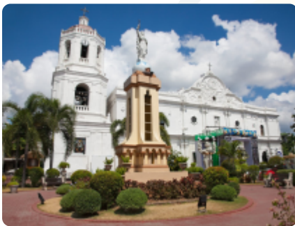
The Cebu Metropolitan Cathedral, Cebu city, Philippines.