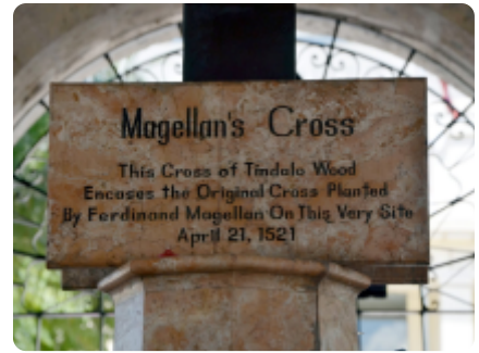
Magellan's Cross in Cebu City, Cebu, Philippines, Southeast Asia