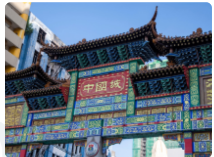
Gates of the Chinatown in Binondo district, Manila