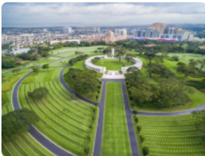
American Cemetery and War Memorial. Located in Fort Bonifacio, Taguig City, Manila