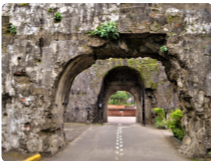
Built in 1571, Fort Santiago is one of the oldest fortifications in Manila, Philippines