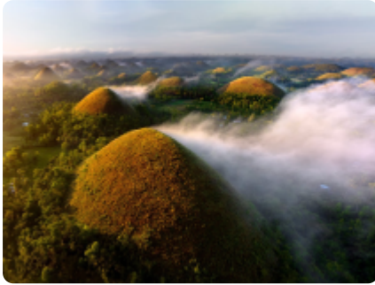
The Chocolate Hills in the Bohol province of the Philippines.