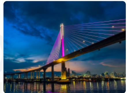
Cebu City, CCLEX bridge illuminated at night, reflecting vibrant colors over the water.