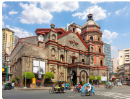
Binondo Church in Manila, Philippines