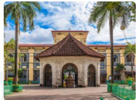
Magellan Cross Pavilion on Plaza Sugbo in Cebu city, Philippines