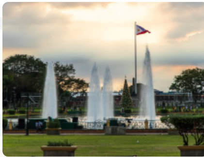
Dancing Fountain at Rizal Park, Manila