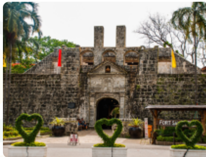
Old Fort San Pedro, Cebu, Philippines