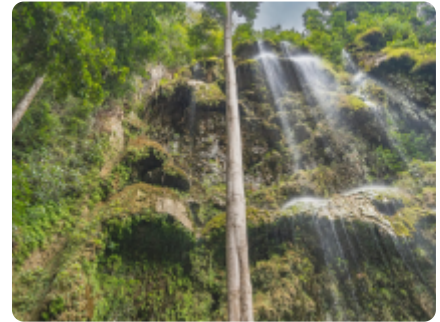
Tumalog falls, Cebu, Philippines