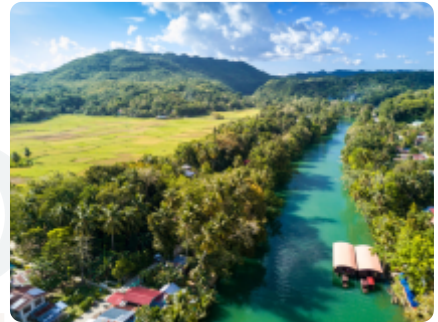
Emerald green colored Loboc river in Bohol, Philippines