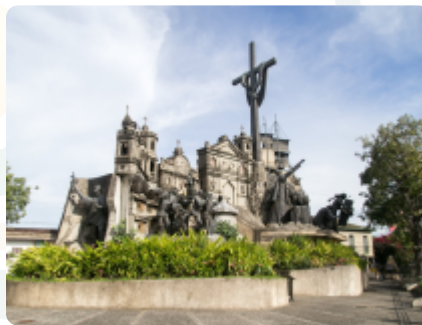
Heritage of Cebu Monument. Its depicts significant moments in Cebu's history start with fatefull fight of April 27, 1521 where Lapu Lapu killed Ferdinand Magellan.