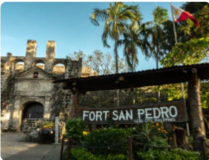
Fort San Pedro, among the top tourist attractions in Cebu City