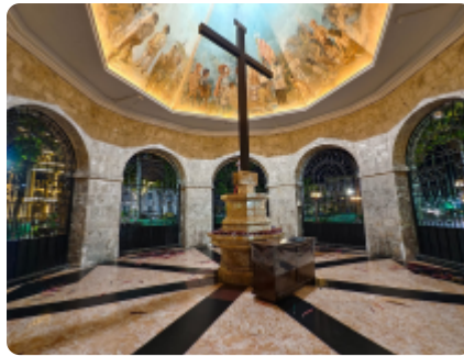
Magellan's Cross at night, showcasing its beautiful mural and historical significance inside a well-preserved stone structure, Cebu