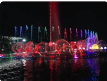
Musical Dancing Fountain in Rizal Park-Liwasang Rizal deemed as the biggest one in the country holds a show of waters soaring up-fireballs-water rockets-peacock spray water screen