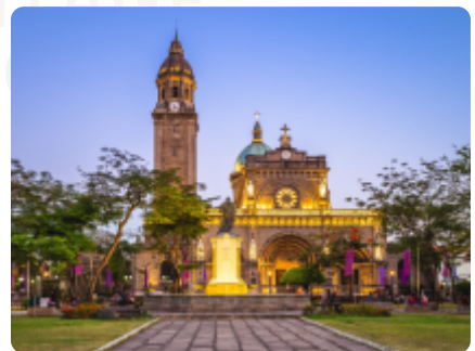
Manila Cathedral, Intramuros, Manila, Philippines