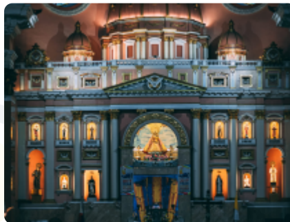
The interior of Minor Basilica of St. Lorenzo Ruiz, in Binondo, Manila