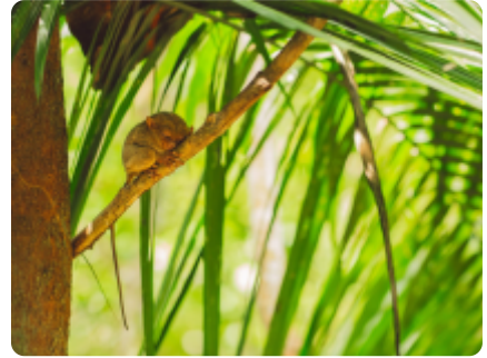
Tarsier - Bohol Island - Philippines