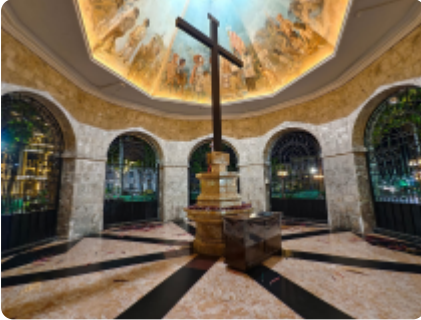
Magellan's Cross at night, showcasing its beautiful mural and historical significance inside a well-preserved stone structure, Cebu