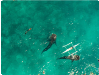
Whale Shark Watching in Oslob, Cebu, Philippines