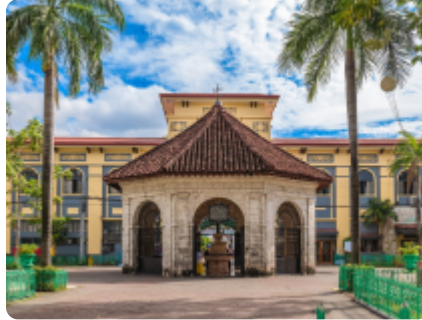
Magellan Cross Pavilion on Plaza Sugbo in Cebu city, Philippines