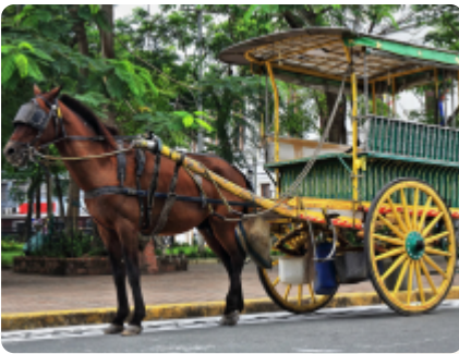
Horse drawn "Kalesa-Calash" at Plaza de Roma Square, Intramuros, Manila.