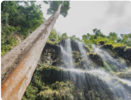
Tumalog falls, Cebu, Philippines