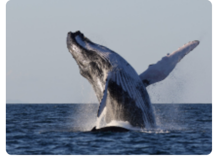
Interaction MB-La mère saute tandis que son baleineau navigue- Cetamada-Ile Sainte Marie, Madagascar-2016