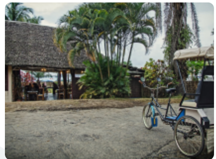
A cafe and a pus-pus taxi in Madagascar