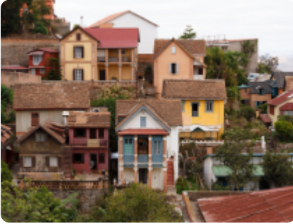
Antananarivo, french name Tananarive, short Tana, Very poor capital and largest city in Madagascar, Madagasikara republic. View to top of Central Antananarivo.