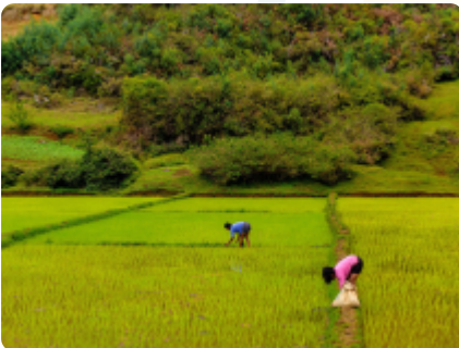
Tana to Anadacibe, Madagascar