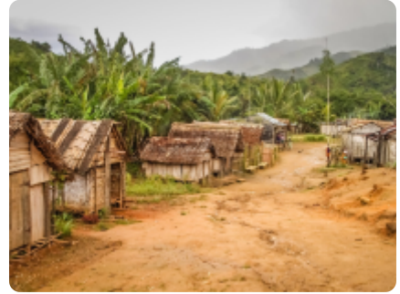
Small village in the mountains in the north east part of Madagascar