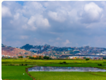
Antananarivo (Tana), Madagascar