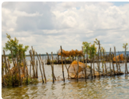
Fishing nets in pangalanes - Madagascar