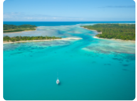
Aerial view of Sainte Marie island, Madagascar