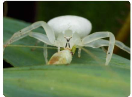
Crab spider photographed in Andasibe madagascar.