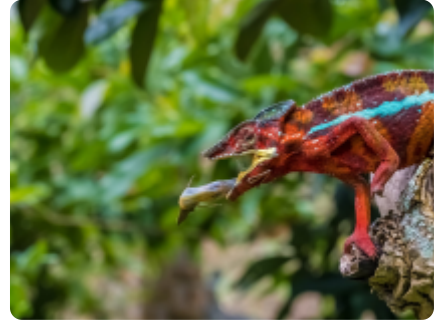
Chameleon in the primeval forests of the Andasibe National Park, Eastern Madagascar