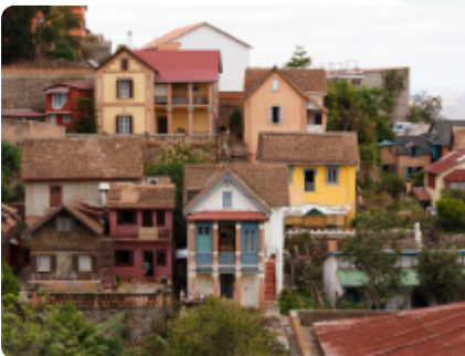
Antananarivo, french name Tananarive, short Tana, Very poor capital and largest city in Madagascar, Madagasikara republic. View to top of Central Antananarivo.

Check out and transfer to the airport for return flight.