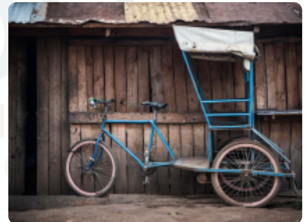
Rickshaw, Antsirabe, Antananarivo Province, Madagascar Central Highlands