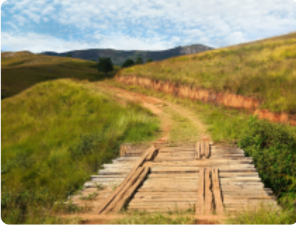
Bridge made of wooden bars on country road, grass growing on hills both sides - typical view when driving 4wd off road vehicle near Andringitra park, Madagascar