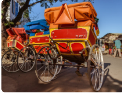
Toamasina, Madagascar, April 30, 2017: Traditional rickshaws near the market in the downtown of Toamasina