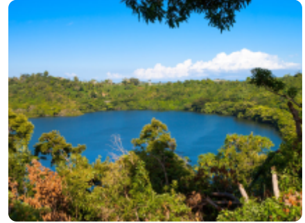
view of madagascar