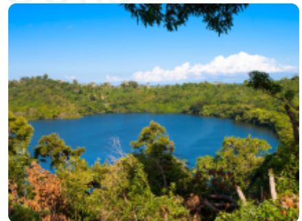
view of madagascar