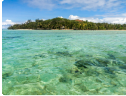
Seascape of Sainte Marie Island (Nosy Boraha), Madagascar