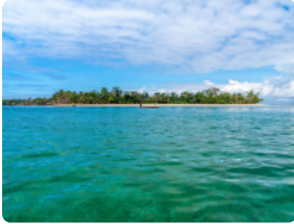
Seascape of Sainte Marie Island (Nosy Boraha), Madagascar