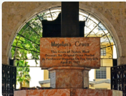
Magellan's Cross marker, Cebu, Philippines.