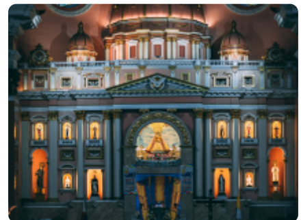
The interior of Minor Basilica of St. Lorenzo Ruiz, in Binondo, Manila