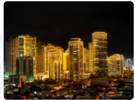
Makati skyline by night, Metro Manila, Philippines