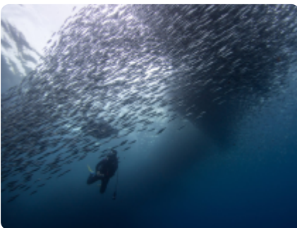
Two scuba divers surrounded by a school of sardines on Bohol, the Philippines