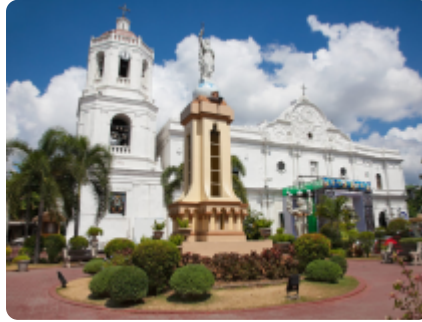
The Cebu Metropolitan Cathedral, Cebu city, Philippines.