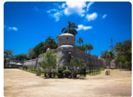
Stone Fort San Pedro in Cebu city, Philippines.