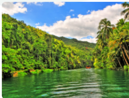
The Loboc River in the Bohol province of the Philippines.