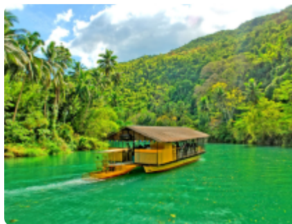
Tourists enjoying in the Loboc River Cruise