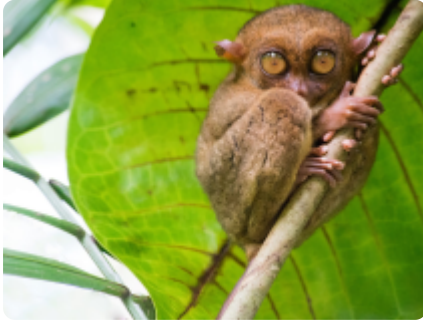
Tarsier, smallest of the primates. Bohol island. Philippines