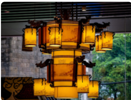
Chinese Lanterns inside a restaurant in Binondo, Manila