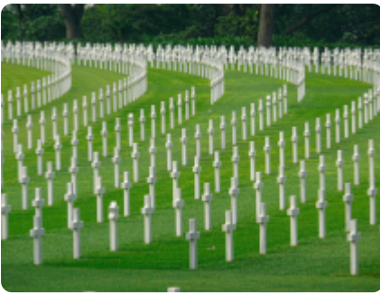
16,363 graves for USA military dead from WWII, including 3,660 unknowns plus 570 Philippine nationals who served with US forces. Also 32,520 American and 3,762 Philippine nationals listed on the walls of the Missing.