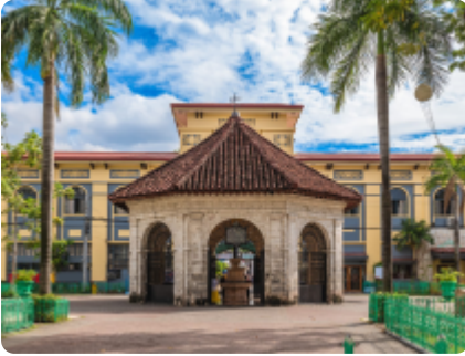
Magellan Cross Pavilion on Plaza Sugbo in Cebu city, Philippines