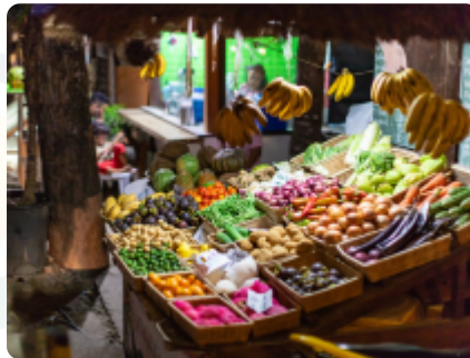
Asian local night market with fruits in Bohol, Philippines.