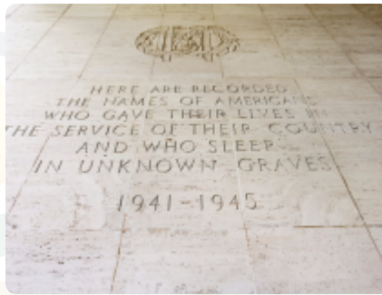
Manila American Cemetery and Memorial, Manila