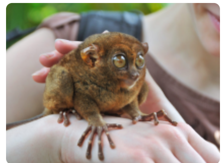
Tarsier - the smallest primate in the world