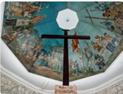
Magellan's Cross is a Christian cross planted by Portuguese and Spanish explorers as ordered by Ferdinand Magellan upon arriving in Cebu in the Philippines on April 21, 1521.