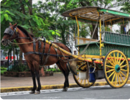
Horse drawn "Kalesa-Calash" at Plaza de Roma Square, Intramuros, Manila.