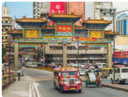
Binondo Chinatown Arch at the entrance from Jones Bridge over Pasig River, Manila