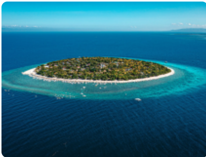
Balicasag Island, with dozens of Bankas amidst vibrant coral reefs.