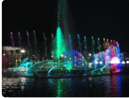
Musical Dancing Fountain in Rizal Park-Liwasang, deemed as among the biggest of its kind.