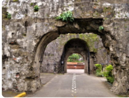
Built in 1571, Fort Santiago is one of the oldest fortifications in Manila, Philippines