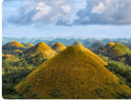
The spectacular and iconic Chocolate Hills, Bohol Island, Philippines