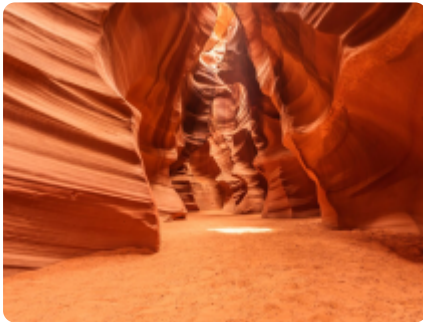
The Siq is a mesmerizing narrow gorge cut into the giant red-sandstone mountain that leads to the world famous 'Treasury', at Petra, Wadi Musa, Jordan