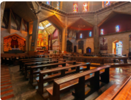
Interior of Annunciation Cathedral in Nazareth, Israel