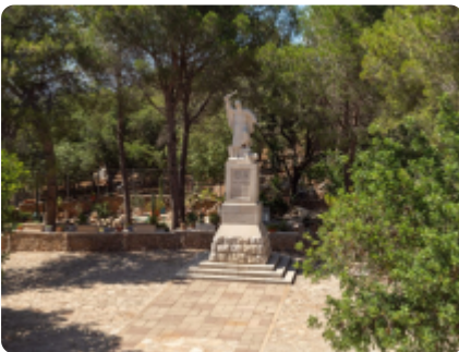
Elijah's statue at the Carmelite monastery at Muhrakha, Dalyat el Carmel, Israel