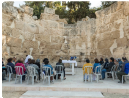
Pilgrims celebrating the Eucharist at Emmaus Nicopolis, Israel