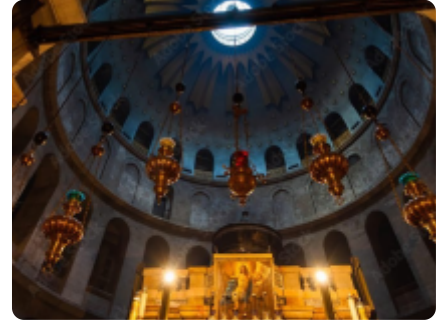
Dome over the tomb of Jesus, interior of the Church of the Holy Sepulchre, Old city of Jerusalem, Israel