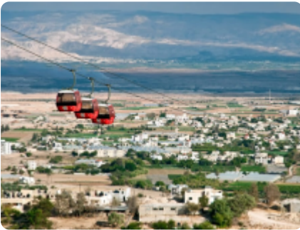
Cable car ride to ascend Mount Temptation, Jericho, West Bank