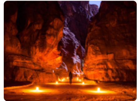
The Siq lit up for the spectacular 'Petra by Night' show, a recently added tourist attraction organized on Mondays, Wednesdays and Thursdays at Petra, Wadi Musa, Jordan