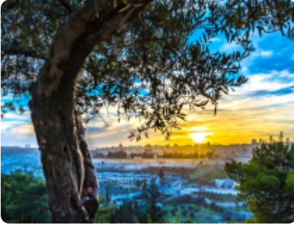
Olive tree with view of Jerusalem