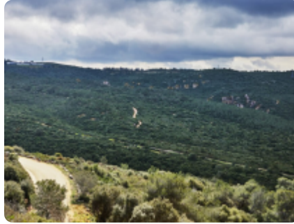
View of the Carmel forest, Mount Carmel, Haifa, Israel