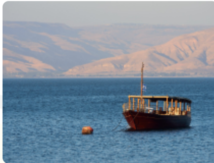
Replica of ancient wooden boat on the Sea of the Galilee, Israel