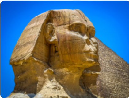
Great Sphinx of ancient Egypt, Giza Plateau, Cairo, Egypt