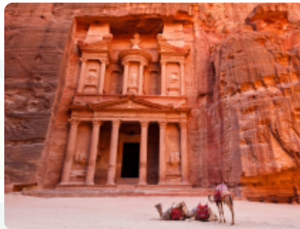
Camels resting in front of the Treasury, known locally as Al Khazneh, located in the UNESCO World Heritage Site of Petra, or Rose-Red city, which was the 6th century capital city of the Nabataeans.