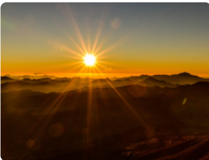
Sunrise over Mount Sinai, Sinai, Egypt