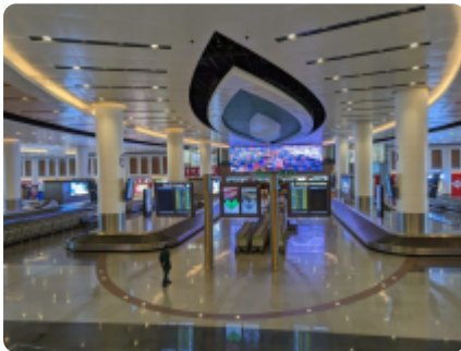
Arrival hall at Queen Aliya international Airport, Amman, Jordan