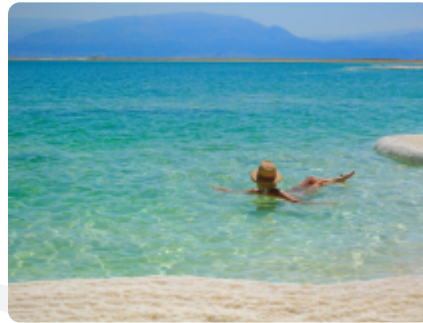
"The Dead Sea float", Dead Sea, Salt valley, Israel