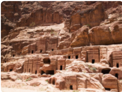
Ancient Tombs, Petra, Wadi Musa, Jordan