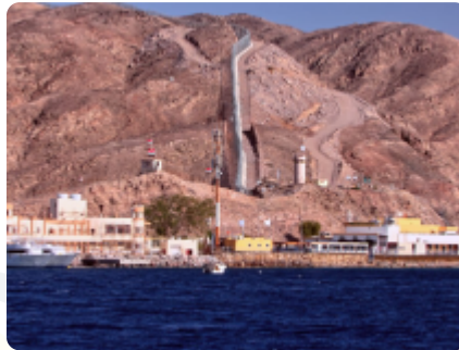
Egypt-Israel border at Taba, Red Sea