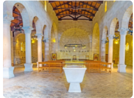
Interior of the church of multiplication at Tabgha, Galilee, Israel