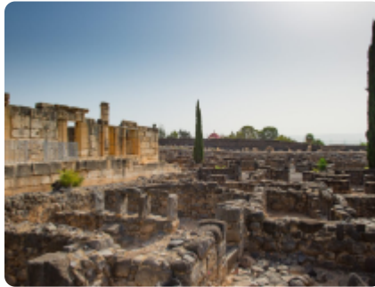
Cpaernaum (Kfar Nahum), the site of Jesus' ministry at the northern shores of the Sea of the Galilee, Israel