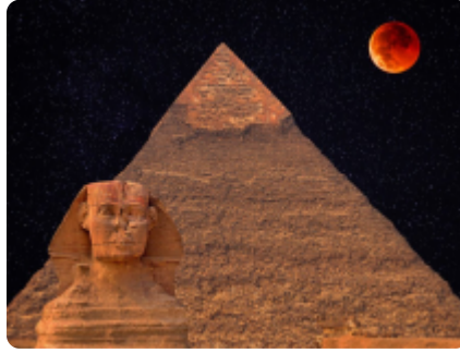
Blood moon rise over the Great Pyramid, Giza, Cairo, Egypt