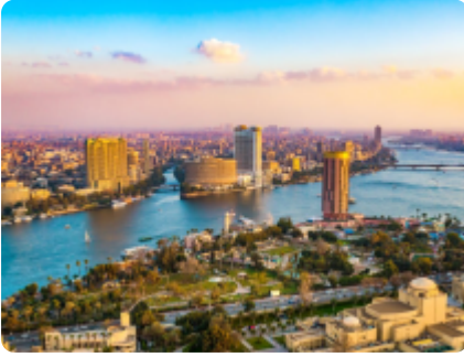
City-scape Cairo City, Egypt