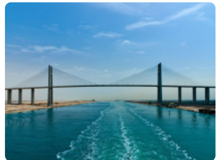
The Suez canal, Egypt