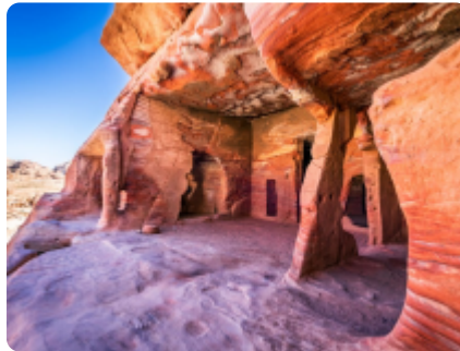
Ancient tombs carved into the massive red-sandstone facades at Petra, Wadi Musa, Jordan