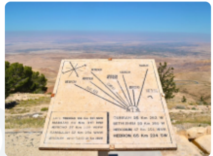
Orientation plaque in marble showing directions and distances from Mount Nebo, Jordan