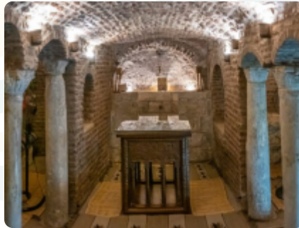
Cave where Holy Family stayed for three months after fleeing to Egypt (Cavern Church or Abu Serge Church), Cairo, Egypt