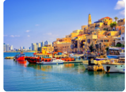
Old town and port of Jaffa and modern skyline of Tel Aviv city, Israel