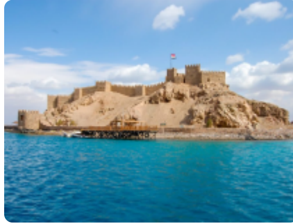
Salah El Din Castle on Farun island in the Gulf of Aqaba, Red Sea, Taba. Sinai, Egypt