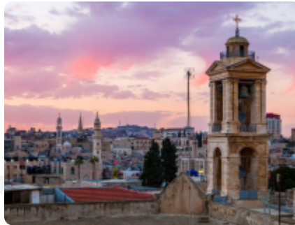
Bethlehem sky at sunset view from rooftop