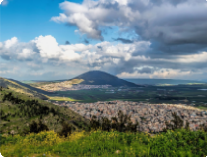
Beautiful view of Mount Tabor from across the Jezreel Valley, Galilee, Israel