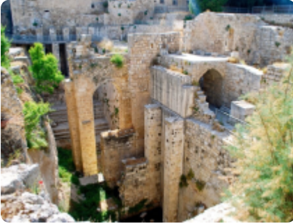
Pools of Bethesda, Old city of Jerusalem, Israel