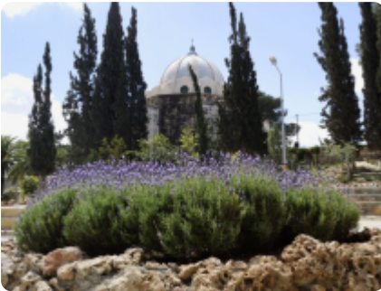
Church at the Shepherd's Field in Biet Sahour, Bethlehem, West Bank