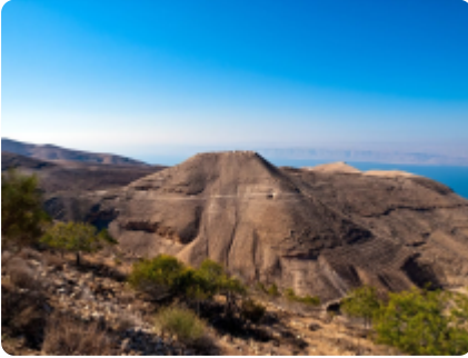
Panoramic view of hill and the fort of Machaerus, widely believed to be the site of the beheading of John the baptist. Mukawir, Jordan