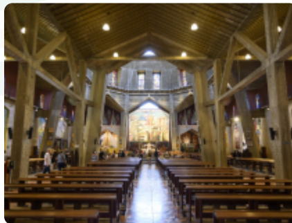
Interior of the Upper Basilica in the Annunciation church complex, Nazareth, Israel