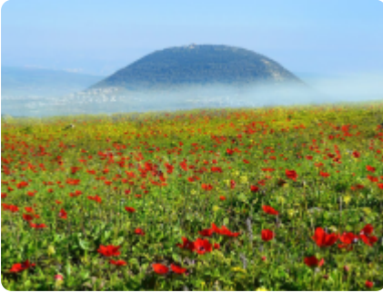
Mount Tabor across a field of poppy blooms, Galilee, Israel