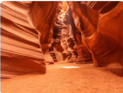
The Siq is a mesmerizing narrow gorge cut into the giant red-sandstone mountain that leads to the world famous 'Treasury', at Petra, Wadi Musa, Jordan