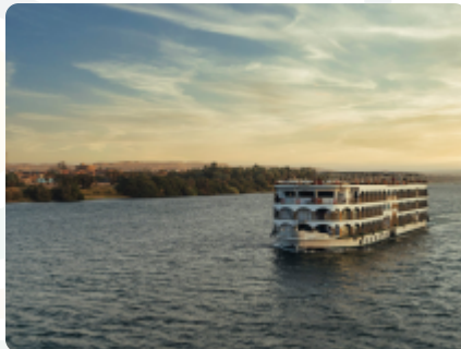
Nile River cruise