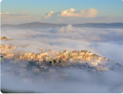
Biblical village Cana of Galilee (Kfar Kanna) in morning fog, near Nazareth, Galilee, Israel