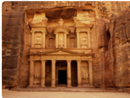
Facade of the 'Treasury' at Petra, Wadi Musa, Jordan