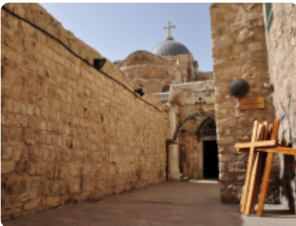
Way of the cross, Old city of Jerusalem, Israel