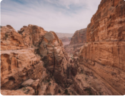
Rock canyon at Petra, Wadi Musa, Jordan