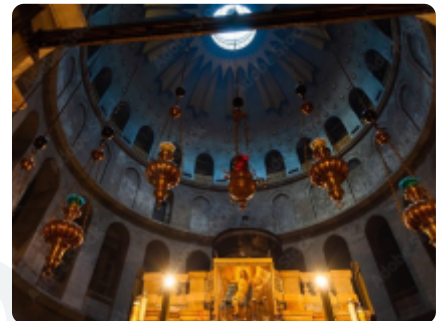
Dome over the tomb of Jesus, interior of the Church of the Holy Sepulchre, Old city of Jerusalem, Israel