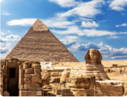
The Sphinx, the Temple and the Pyramid of Chephren under the clouds in Giza.