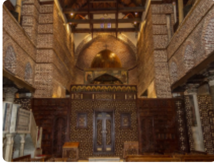
Fascinating detail of the interior of the ancient Coptic Church, Cairo, Egypt