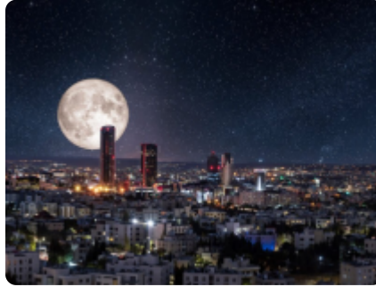
Full moon rise over Amman city, Amman, Jordan