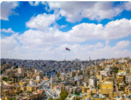
Panoramic View of Amman city