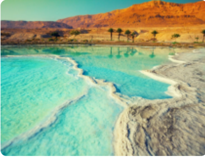
Dead Sea, Salt valley, Israel