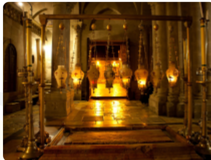
Anointing stone, church of the Holy Sepulchre, Old city of Jerusalem Israel