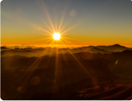
Sunrise over Mount Sinai, Sinai, Egypt