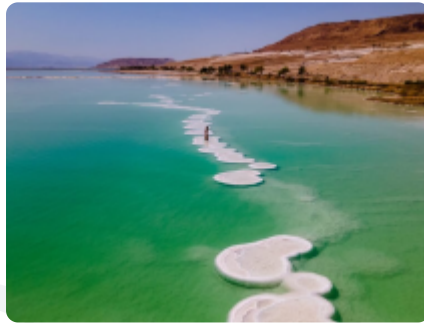
Salt deposits, Dead Sea Israel