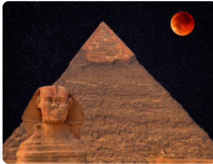
Blood moon rise over the Great Pyramid, Giza, Cairo, Egypt