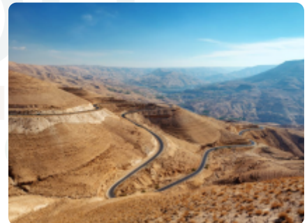
The Kings highway en route Petra, Jordan