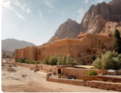
Saint Catherine monastery at the foothill of Mount Sinai, St Catherine, Sinai, Egypt