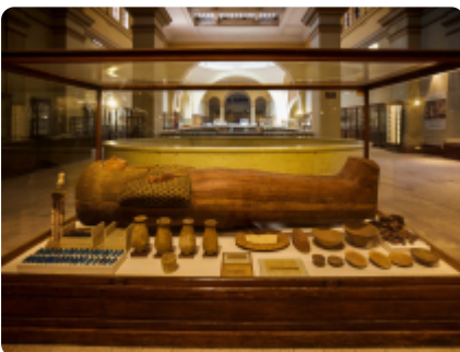
Sarcophagus in the Egyptian National Heritage Center, Cairo, Egypt