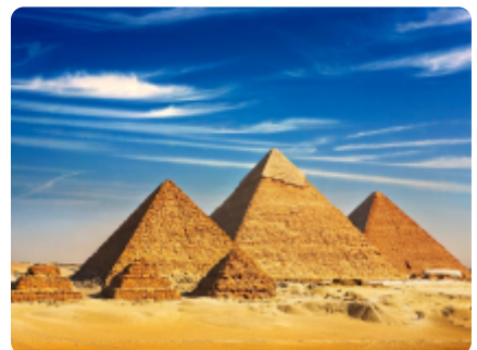
Pyramids at the Giza Plateau, Cairo, Egypt