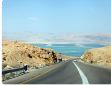
Highway to Sinai, Road 90-Arava valley, Israel