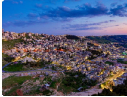
The Skyline of Amman, Jordan at Sunset