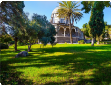
Church at Mount Beatitudes, site of the Sermon on the mount, Galilee, Israel