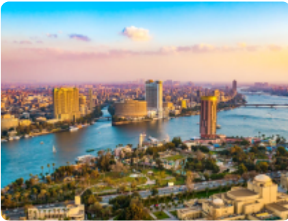
City-scape Cairo City, Egypt