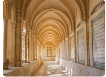
Our Lord's prayer in various languages on the walls of the church of Pater Noster, Mount of Olives, Jerusalem, Israel