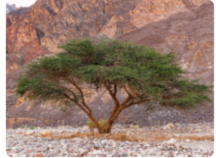
A single umbrella thorn Acacia in the Eilat mountains of Israel with a red rocky mountain slope in the background