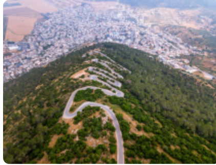
Winding snake road to ascend Mount Tabor, Galilee, Israel