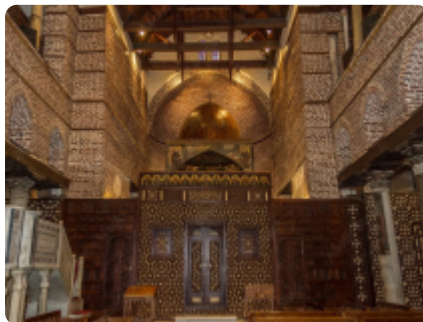
Fascinating detail of the interior of the ancient Coptic Church, Cairo, Egypt