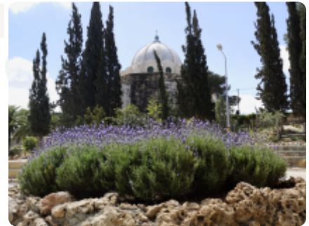
Shepherds Field, Beit Sahour, Bethlehem