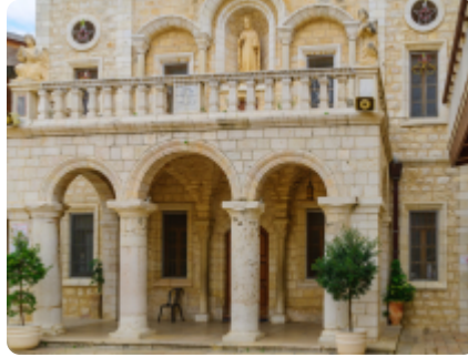
The facade of the Catholic Wedding Church, Cana, Galilee, Israel