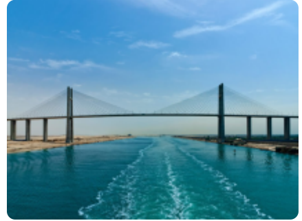
The Suez canal, Egypt