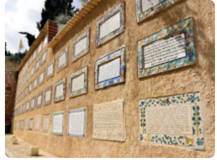
Magnificat Wall at the Basilica of Visitations, Ein Kerem, Jerusalem, Israel