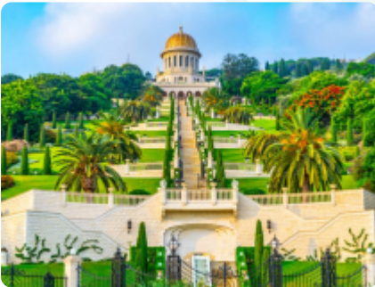
Beautiful Bahai gardens in Haifa, Israel