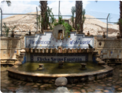
Water from the Spring of Elisha, Jericho, West Bank