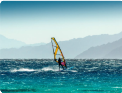
Wind surfing off the coast of Eilat, Red Sea, Israel