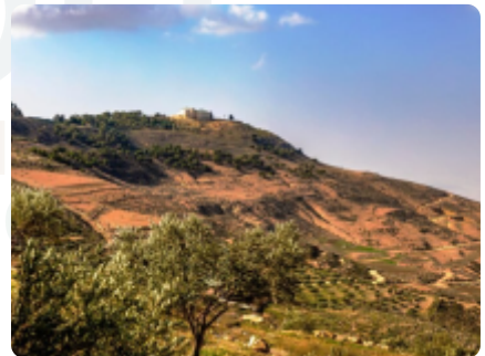
Panoramic view of Mount Nebo, Jordan