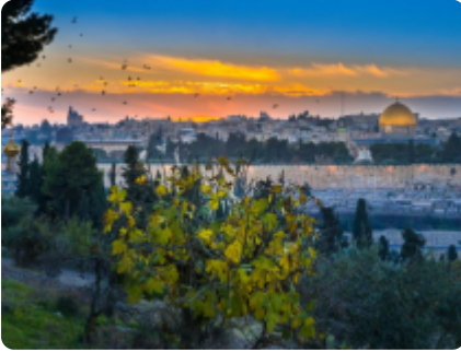
Beautiful autumn sunset over the Old City Jerusalem, with Dome of the Rock, Golden Gate and birds flying over the Russian Orthodox church of Mary Magdalene - view from the Mount of Olives