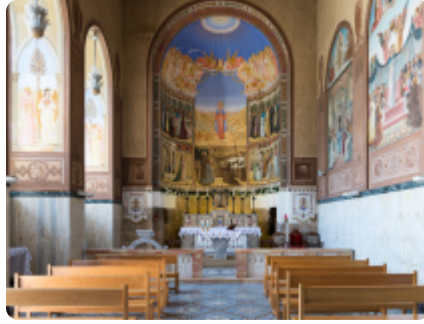
Interior of the Basilica of Visitations, Ein Kerem, Jerusalem, Israel