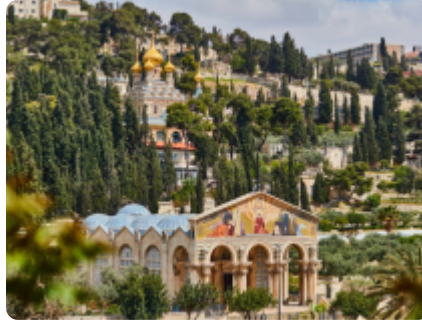
Basilica of Gethsemane with Church of Mary Magdalene in the background, Jerusalem, Israel