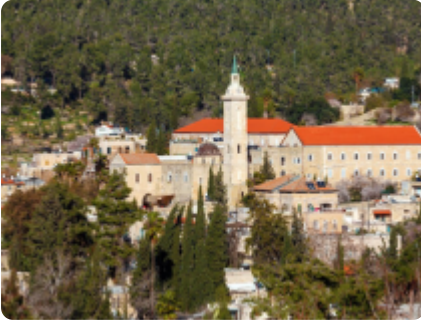
Ein Karem, Birth place of John the Baptist, Ein Karem, Israel