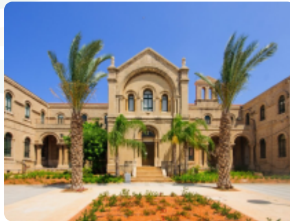
Stella Marris convent & chapel at Mount Carmel, Haifa, Israel