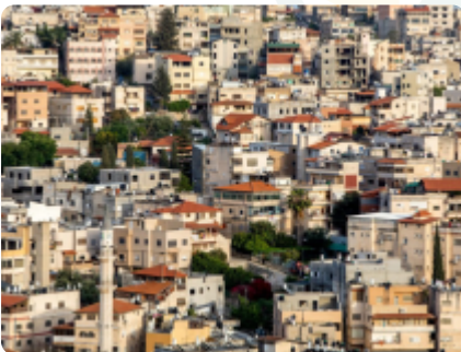
Nazareth city, Galilee, Israel.