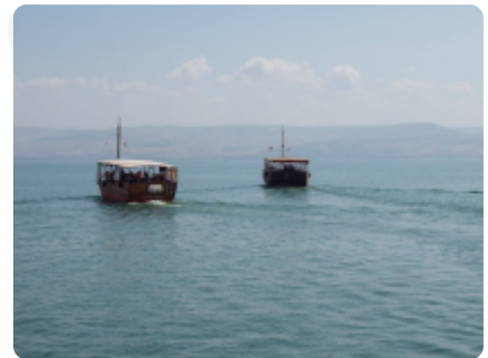
Wooden boats floating on the Sea of Galilee, Israel. Sunny day on Kinneret.